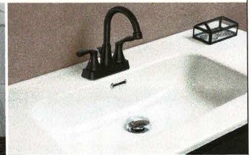
Deveral 4 in. Centerset 2-Handle High-Arc Bathroom Faucet in Matte Black (319945924)

Visit homedepot.com/bath for more details.