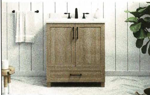
Tobana 30 in. Vanity (319785942)